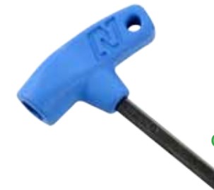
CA1010 Hex Key 5 mm